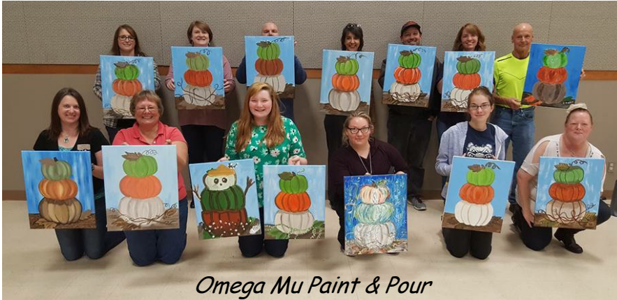
Omega Mu Paint & Pour

Omega Mu hosted another Paint & Pour on 11/12 benefitting Easter Seals. We were able send our friend a check for $58 while having an amazing time with friends. The completed pictures and the food were fabulous.