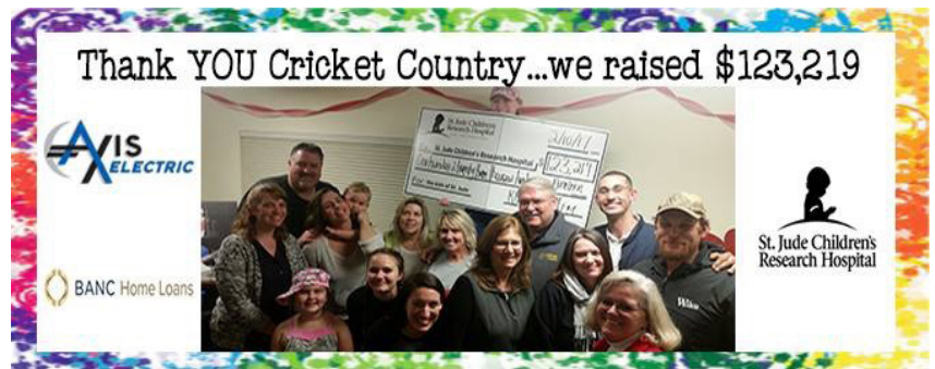
Final Check and group photo for St Jude

We had a fun time at the St. Jude Children's Research Radiothon hosted by our friends at KRKT Cricket Country. The Radiothon brought in.....drum roll please.....a whopping (and new record breaking) total of $123,219.00. Love to hear positive things happening for St. Jude.