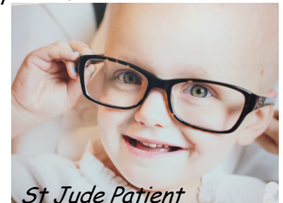
St Jude Patient