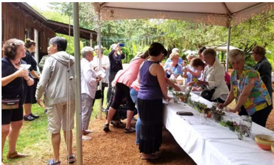
Making herb infused vinegar...yum!