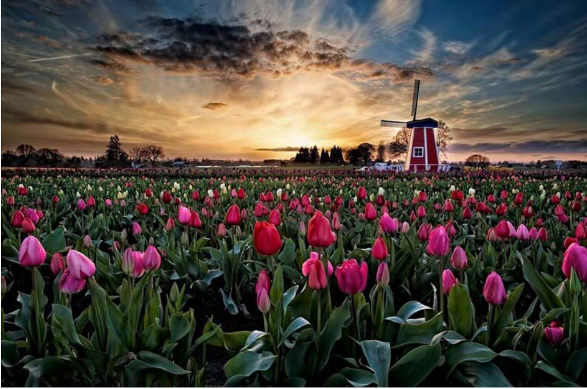
Wooden Shoe Tulip Farm

Easterseals Oregon | 503.228.5108 events@or.easterseals.com www.easterseals.com/oregon