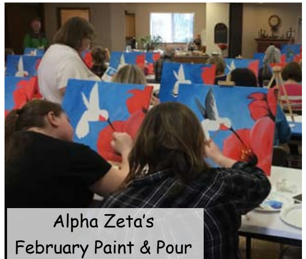
Alpha Zeta's February Paint & Pour