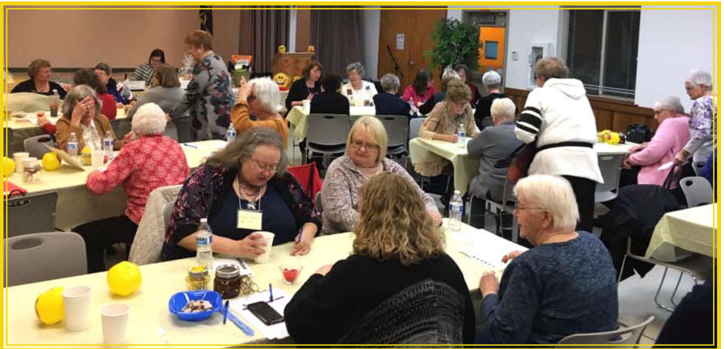
Bunco Nite at Winter Meeting!