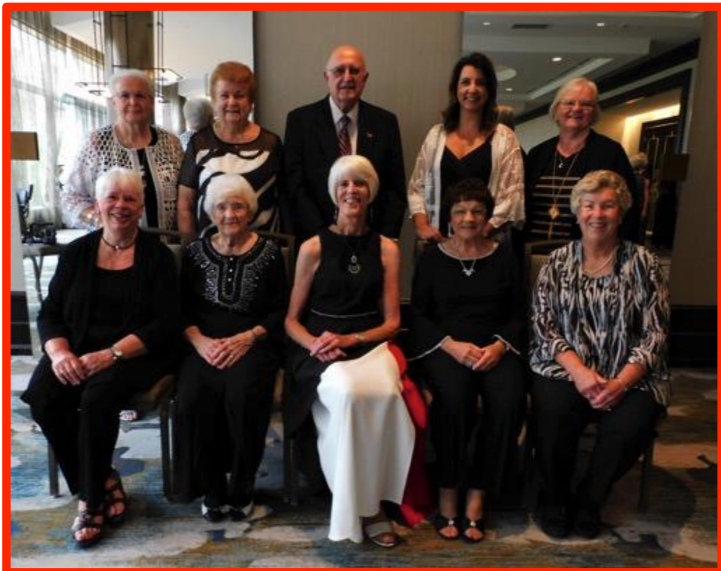
Below: Oregon State at IC Banquet