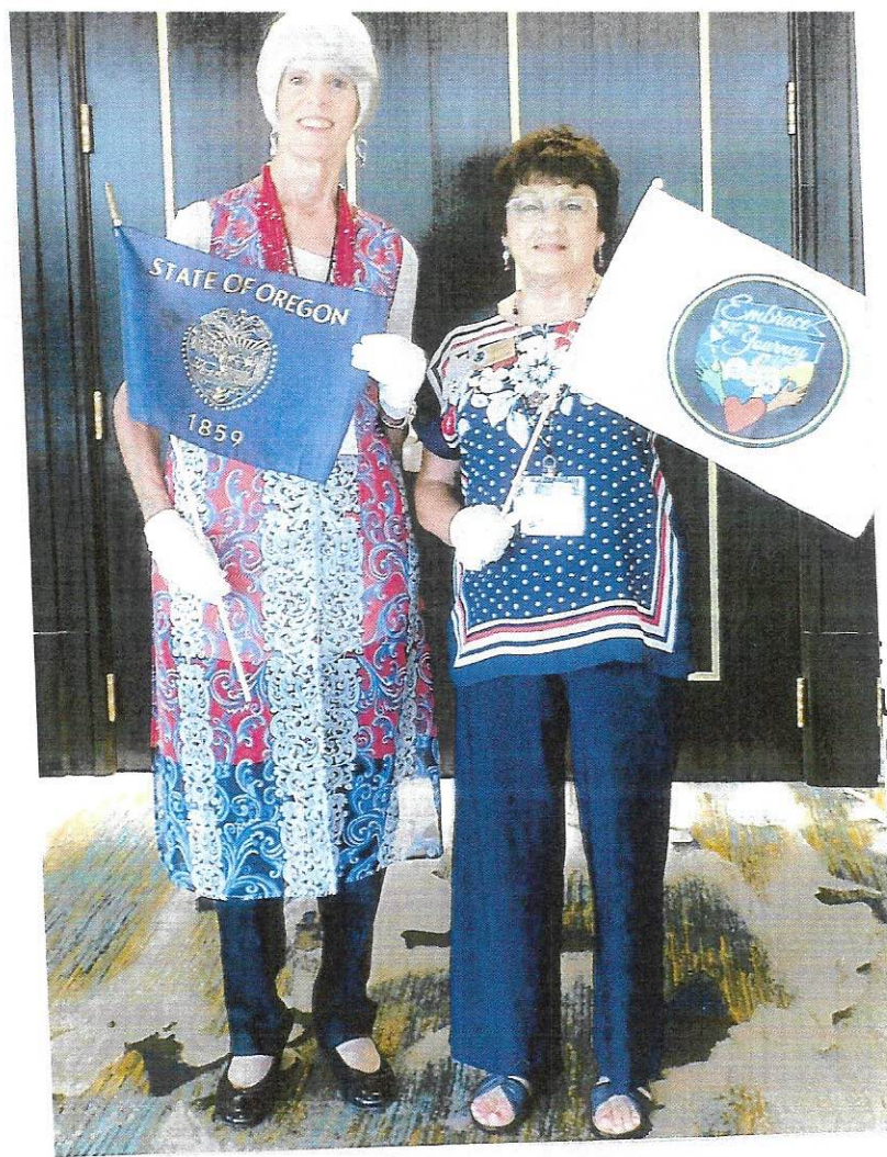
CONVENTION 2021 JULY 26 – AUGUST 1 LOUISVILLE, KENTUCKY